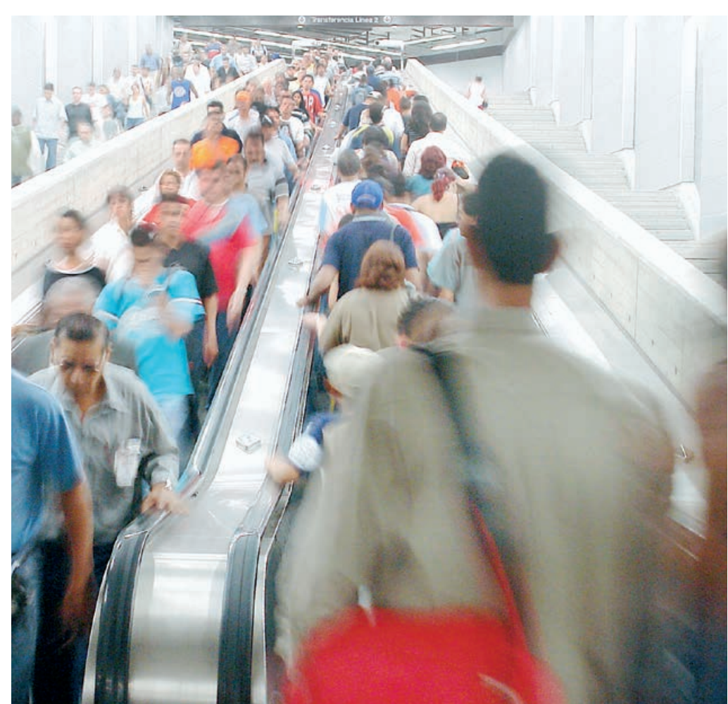
Escalators and Moving Walks for Public Transport When moving masses means individual comfort